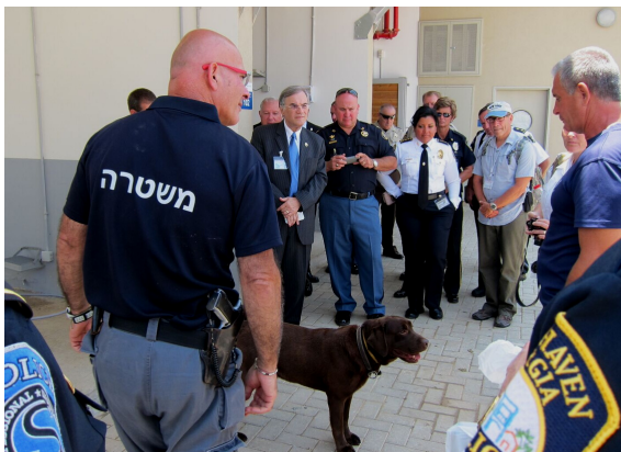
Georgia police officials engaging in training with armed Israeli police.

China runs a massive surveillance state that restricts the civil liberties of its citizens. Protesting is forbidden. So is voting. Activists are subject to arrest. [23] Police have raided “unsanctioned” churches, destroying crosses and burning Bibles. [24] One million Uighur Muslims sit in Chinese concentration camps. [25]