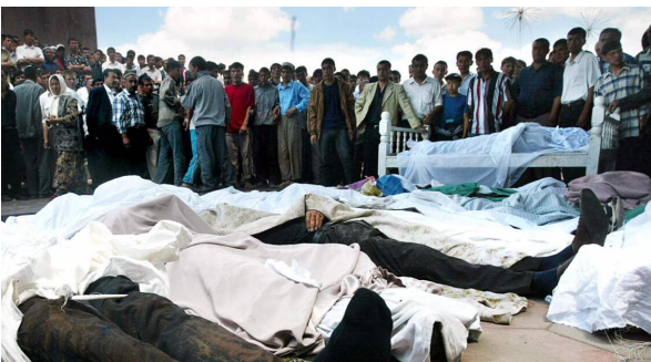
Aftermath of 2005 police massacre in Uzbekistan.

For example, Egyptian police officers have arrested activists, tortured dissidents, performed "virginity tests" on detained women, [13] conducted rectal "examinations" on men arrested for waving rainbow flags, [14] and crushed protests, including a 2013 assault on a sit-in that killed over 800 Egyptians. [15]