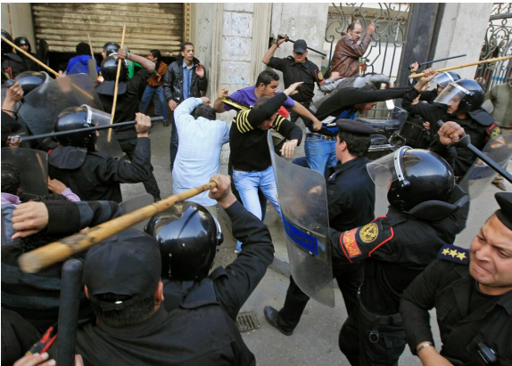
Egyptian riot police attacking protesters, 2011

GILEE publicly advertises partnerships with foreign governments which use their law enforcement agencies to restrict civil liberties, commit human rights violations, and/or promote bigotry, including sexism, anti-Semitism, and Islamophobia.