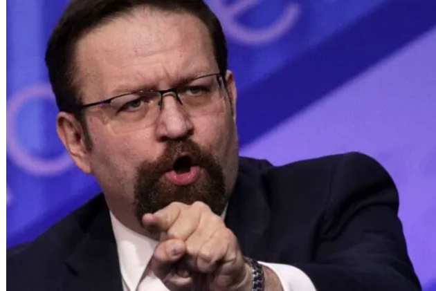
Sebastian Gorka, former Deputy Assistant to Donald Trump

GILEE partners with foreign organizations that promote anti-Muslim bigotry under the guise of countering terrorism. [47] For example, a GILEE partner, the International Counter-Terrorism Academic Community (ICTAC), includes members such as Sebastian Gorka, [48] the anti-Muslim activist, former Breitbart writer, and Fox News contributor who left the Trump Administration months after allegations surfaced that he had supported an anti-Semitic militia and a Nazi-allied group in his native Hungary. [49][50][51] To Gorka, terrorism is rooted in Islam and the "martial parts" of the Quran that he says inspire some Muslims to commit terrorism. [52]