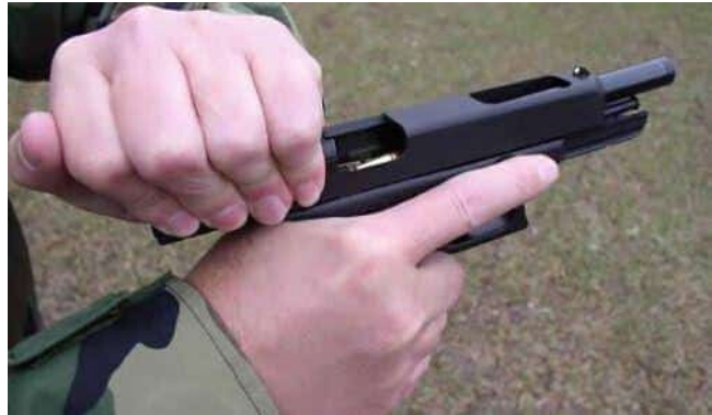
"Racking", pictured above, is a fear tactic taught by GILEE

Among other things, GILEE has taught that officers should inspire fear by “racking” their firearms when they unholster them, which is a common tactic that Israeli officers use against unarmed Palestinian protesters. [9] GILEE also encourages police officials to direct their officers to flash the blue lights on the roof of their vehicles while patrolling certain neighborhoods. [10]