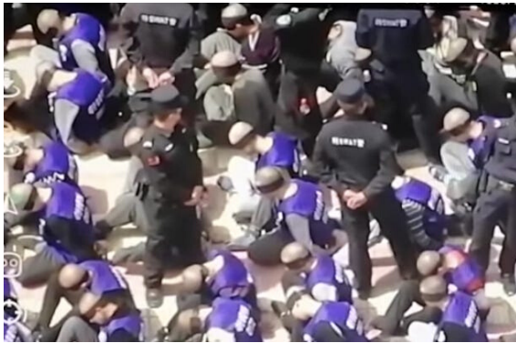
Hundreds of blindfolded prisoners in Xinjiang, western China.

Since 2010, the Hungarian government has been led by a far-right political party that promotes anti-Semitism and xenophobia. [21] Officials “are increasingly hostile to journalists and critics, and engage in anti-migrant, anti-Muslim and xenophobic rhetoric including through publicly funded campaigns.” [22]