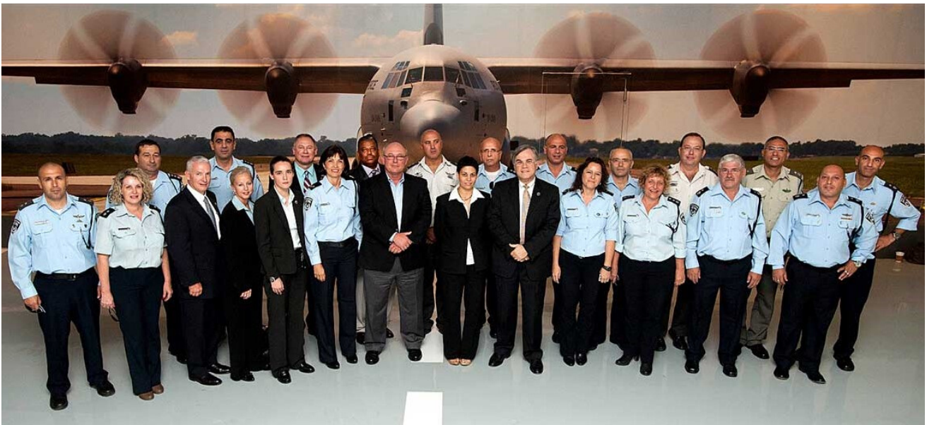
Police officials posing in front of military plane at GILEE meeting in Israel, October 2012

By allowing police officials to train with governments that violate human rights, Georgia is running a serious risk that our officers will learn dangerous policing methods, bring those methods back home, and apply them to the residents of Georgia.