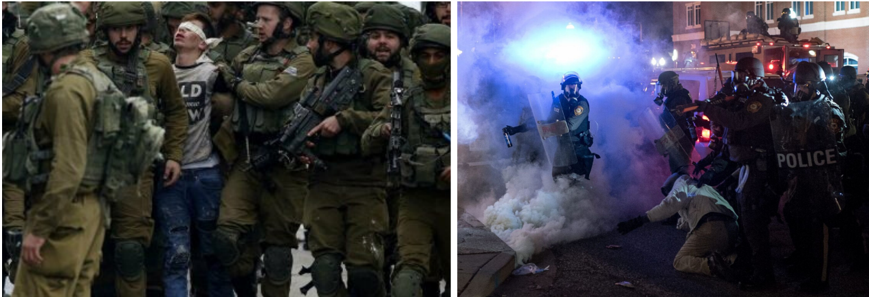
Law enforcement action in Israel (left) and in America (right).