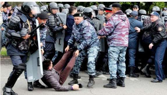
Kazakhstan riot police attacking peaceful protestors